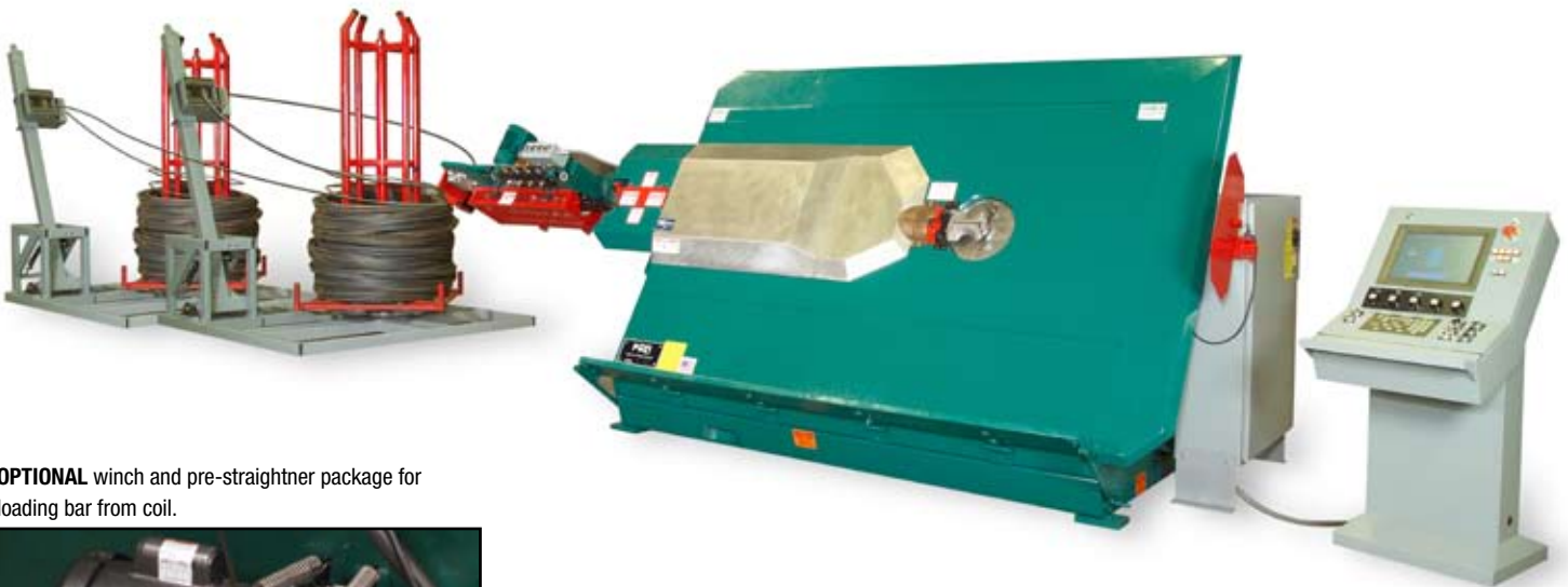
OPTIONAL winch and pre-straightener package for loading bar from coil.